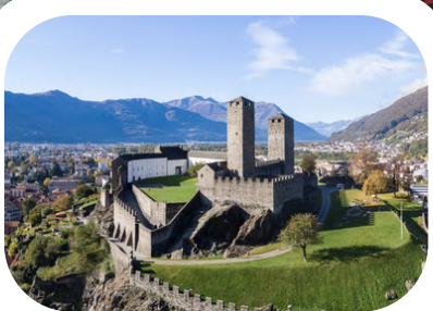
3 UNESCO heritage castles