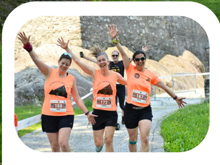
11 Km RUN