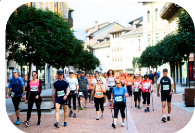
11 Km WALKING